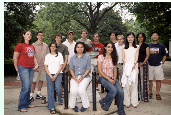
Fig. 3: Berger research group pictured with the REU participants (Summer 2003).